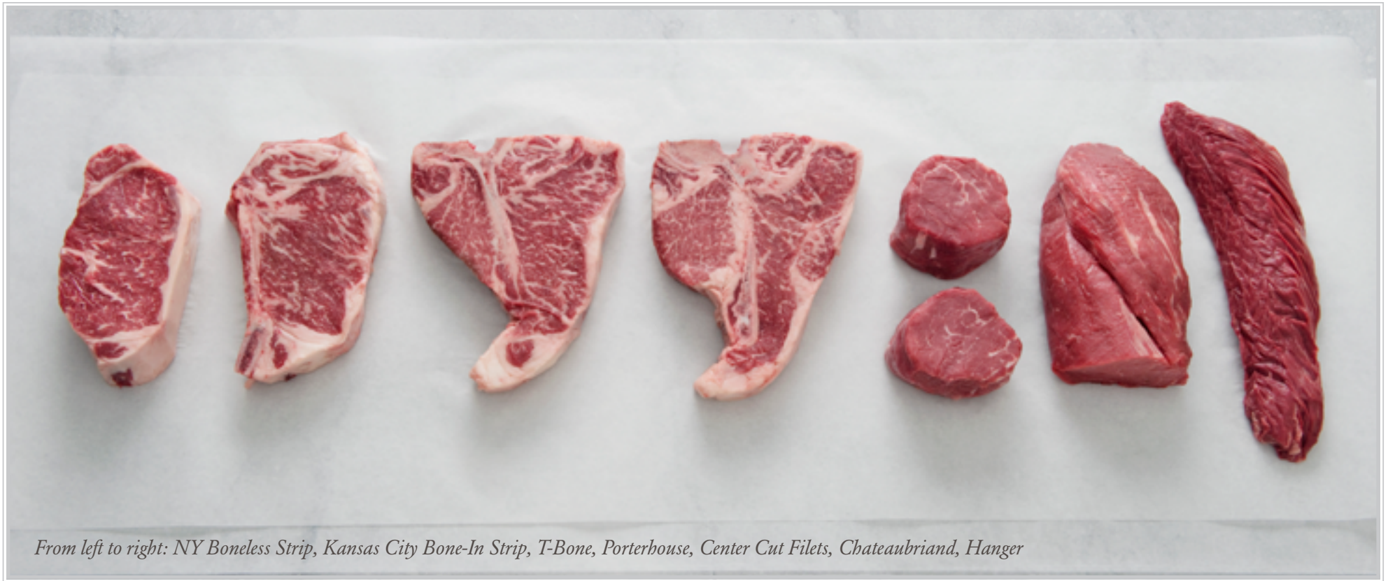
From left to right: NY Boneless Strip, Kansas City Bone-In Strip, T-Bone, Porterhouse, Center Cut Filets, Chateaubriand, Hanger