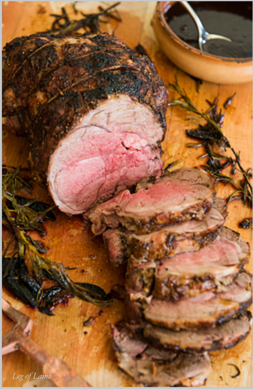
Leg of Lamb