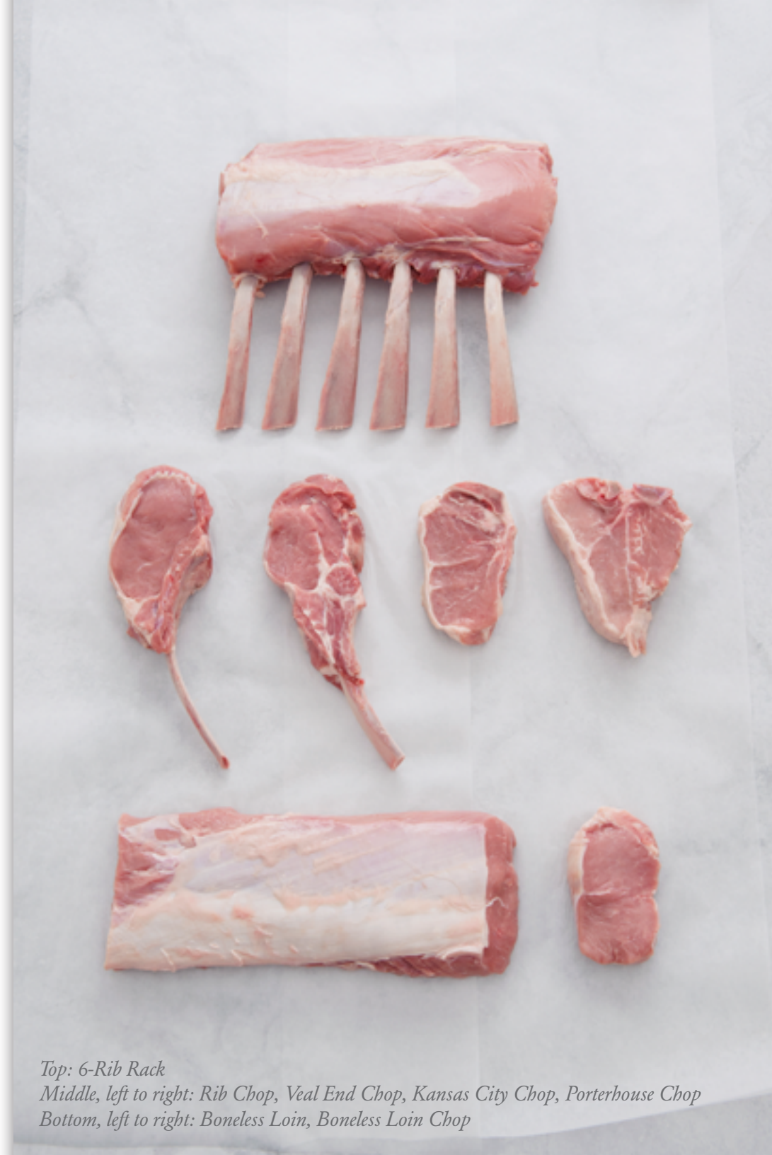
Top: 6-Rib Rack

THE BEAUTY OF VEAL IS THAT ITS FLAVOR IS NEARLY NEUTRAL, ALLOWING CHEFS TO DOMINATE THE DISH