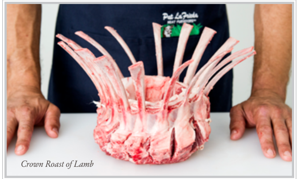
Crown Roast of Lamb