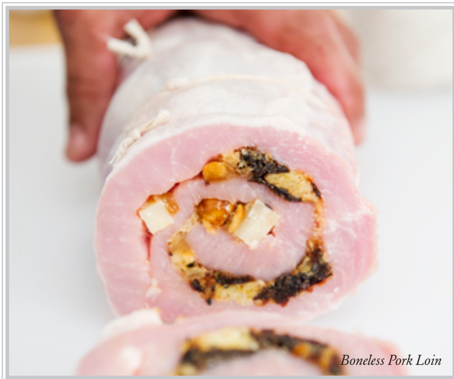
Boneless Pork Loin