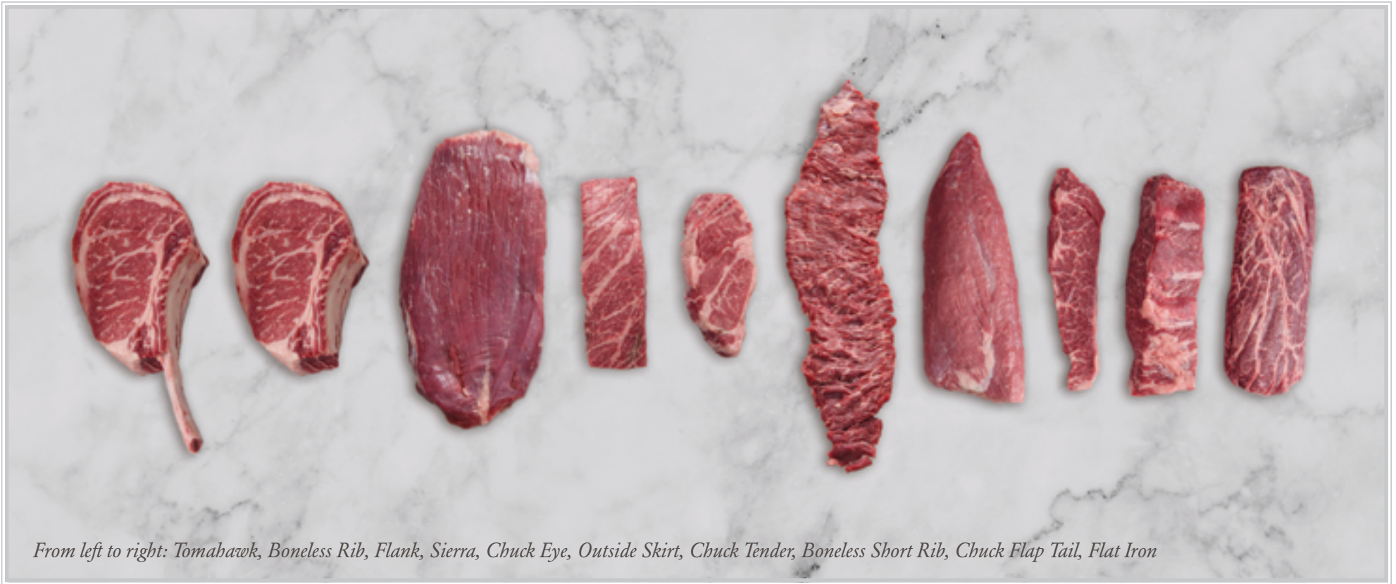
From left to right: Tomahawk, Boneless Rib, Flank, Sierra, Chuck Eye, Outside Skirt, Chuck Tender, Boneless Short Rib, Chuck Flap Tail, Flat Iron