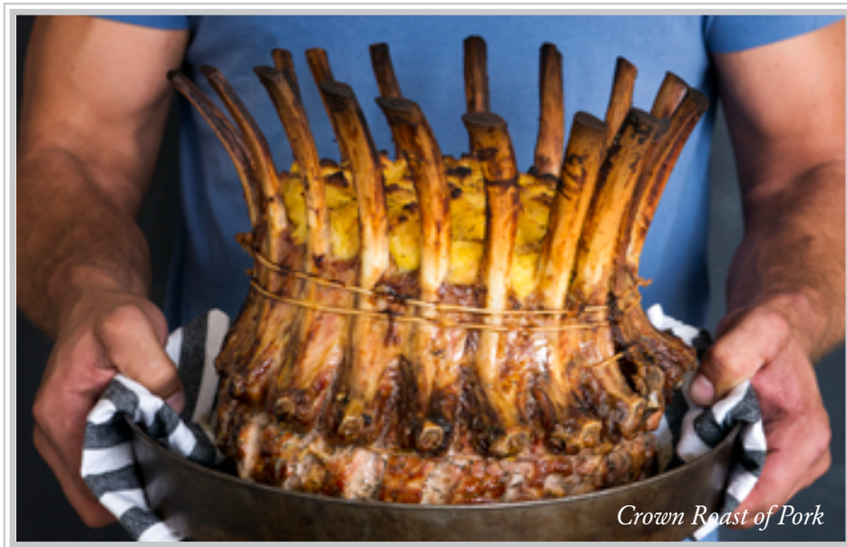
Crown Roast of Pork

Head Ear Jowl Cheeks Snout Tail Skin Fatback Caul Fat Blood Kidneys